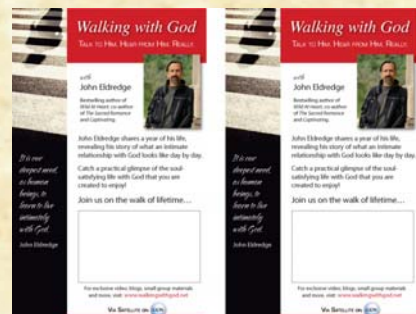
WWG Church Insert